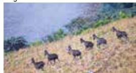
Nilgiri Tahr - Nilgiritragus hylocrius

bird species like the Nilgiri Laughing Thrush. But it is not the fauna so much as the flora that gives the Nilgiris its unique position in the entire Western Ghats. In this connection, two points need to be considered.