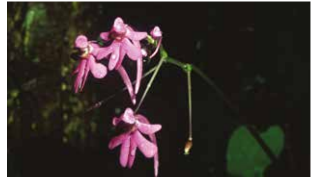
Impatiens denisonii - endemic to upper Nilgiris

The first is the presence of a large number of what are basically Himalayan genera in this area. These include the Rhododendron , Lilium , Ilex , Geranium , Berberis , and many others. Some mammals, like the Nilgiri Tahr, Nilgiri Marten, and birds such as the Nilgiri Laughing Thrush, also have their closest relatives in the distant Himalayas. Some identical floral species like Impatiens chinensis , Satyrium