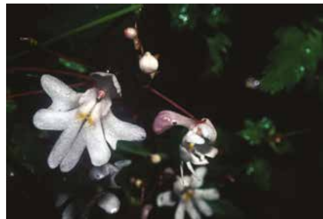
Impatiens taihmushkulni : a newly described endemic species of wild balsam

Another project that is underway is the conservation of the Toda breed of buffalo around which the entire cultural edifice of this community is based. The 'Toda buffalo' represents one of the few breeds of the Asiatic water buffalo, Bubalus bubalis , and like their masters, is restricted to the Nilgiris. Hence, it is very important