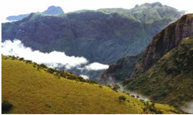
Nilgiri Upland Island: the western edges of the Nilgiris are in the form of steep escarpments