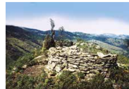
Prehistoric remains - Stone Circle

prehistoric sites scattered throughout the hills that could be related either to one or more of the indigenous peoples. These prehistoric sites comprise stone and earthen circles, cists, dolmens, shrines and rock art.