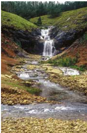
Taihhb-warshy-pahh: a waterfall sacred to the Todas.

The Todas' pastoral way of life, combined with their non-martial, non-hunting, pacifist, and vegetarian lifestyle (all very rare traits among indigenous groups) has surely played a significant role in ensuring the survival and prospering of the flora and fauna that surround their settlements. Even today, Todas meet with introspection, rather than anger and a desire for revenge, the loss of a buffalo to a predatory tiger residing in the vicinity of their hamlets. Extraordinarily, they are able to accept their loss as being a kind of benediction.