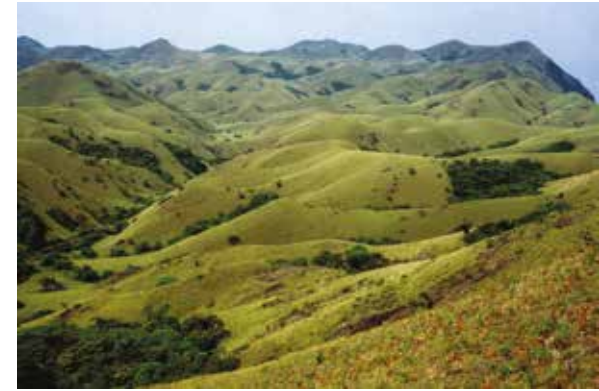
The shola-grassland mosaic is typical of the Upper Nilgiris