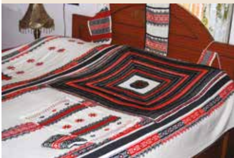
Toda Embroidered products

The Toda Nalavaazhvu Sangam (Toda Welfare Society/ TNS) is a sister organisation of EBR, and dates back to 1992. This organisation has been instrumental in reviving Toda culture: from the reoccupation of several seasonal hamlets, sometimes after a hiatus of many decades; the rebuilding of a number of very sacred dairy-temples; the revival of traditional barrel-vaulted housing; promotion of traditional art forms like the embroidery performed by Toda women – the TNS obtained the prestigious Geographical Indication (GI) patent from the Government of India a few years ago; to more mundane necessities like facilitating the provision of basic amenities like electricity at remote hamlets, footpaths, water supply, buffalo loans, etc by the district administration, and raising funds for medical exigencies as well as for educational support and other welfare schemes.