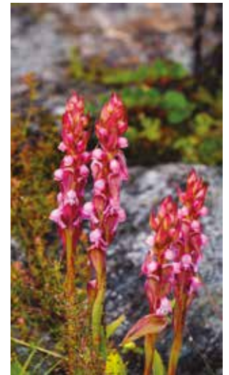
and in Sikkim