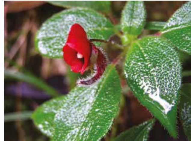
A Gondwanaland relic: Impatiens munronii

the Indian subcontinent. For example, some of the Nilgiri Impatiens (wild balsams) species, like Impatiens munronii and Impatiens jerdoniae , are directly related to African species, and can be linked to a common ancestor from an unknown family in ancient Gondwanaland. Since the existing sholas are presumed to be relics of what were once far more extensive primeval forests dating back to Gondwanaland, they are sometimes referred to as 'living fossils'. The species that survived the drought managed to do so by becoming isolated within montane forest and grassland refuges in the Western Ghats. Long periods of isolation during intense drought conditions led to their evolution into distinct, endemic neo-species. The fact that the