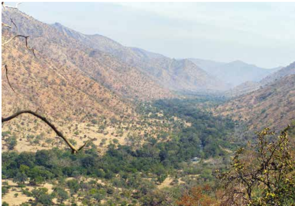
Dry deciduous forests of the Moyar Gorge, one of the outstanding geological formations of the Nilgiris.