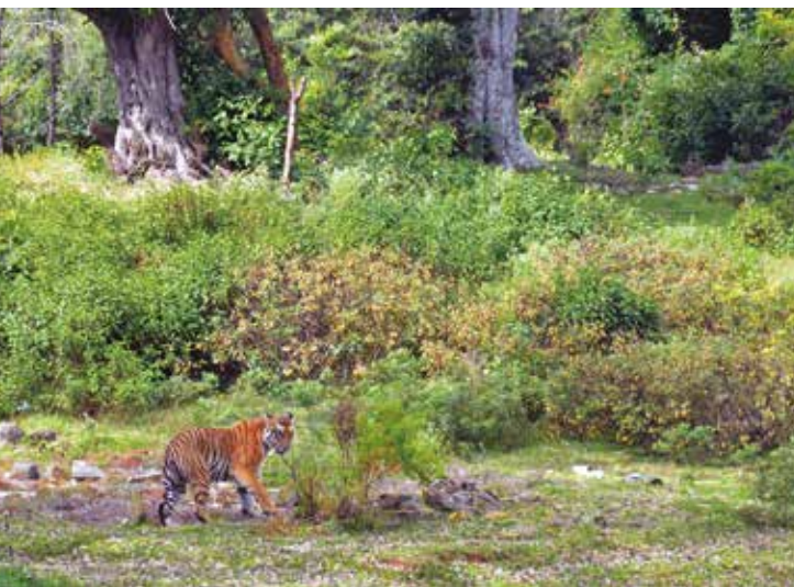
A tiger around a Toda hamlet

The Nilgiris is home to several endangered mammals, such as the Nilgiri Tahr, Tiger, Nilgiri Langur and Nilgiri Marten, as well as flagship