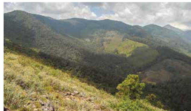
The EBR landscape showing the central area that is being ecologically restored.

in situ plantation on the acquired tract. Tea bushes and other weeds have been removed from a portion of the land and native flora has been planted. However, a majority of the EBR land still needs to be restored, and at the moment, we have erected a solar fence (since grazing from herbivores like Sambar and Mouse Deer is a major challenge initially) and the weeding followed by planting of native tree saplings, shrubs and grasses has been undertaken.