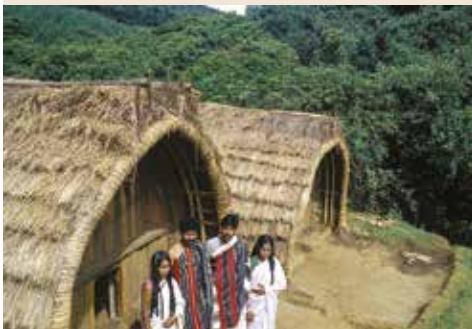
Traditional Toda dress