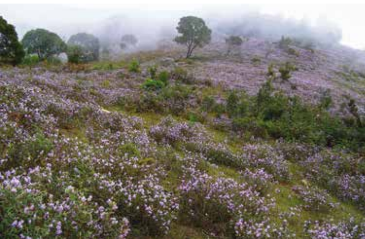
Strobilanthes kunthianus mass flowers in twelve-year cycles

The Nilgiris is now a major tourist destination, and sadly, has all the trappings of a modern Indian hill station. But there are two protected national parks: Mukurti and Mudumalai, the latter now a National Tiger Reserve. These two national parks form the core areas of the Nilgiri Biosphere Reserve (NBR), the first of its kind to be established and be UNESCO-recognised in India. This reserve spans over 5500 sq. km., and the Nilgiris not only constitutes its heartland, but also lends it its name.