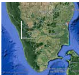
Satellite image of the Nilgiri Biosphere Reserve

The Edhkwelynawd ('place with a spectacular view' in Toda) Botanical Refuge (EBR) is a small oasis in the Upper Nilgiris of south India where a silent movement to restore an ancient ecological landscape is taking shape with the effort of ordinary citizens.