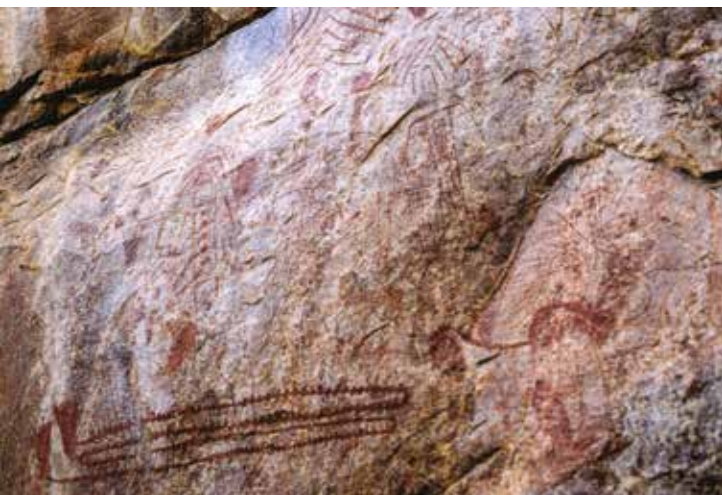
Prehistoric Rock art

Unfortunately the environment has been changed considerably since independence, with once vast areas of virgin grassland now planted with exotic trees like eucalyptus, black wattle and pines to supply raw material to the viscose industries in the plains. Large wetlands have also been inundated by numerous reservoirs to meet the hydroelectric power requirements of Tamil Nadu, while much of the remaining area is now under tea and vegetable cultivation. With the result, the globally significant shola-grassland mosaic is under threat of disappearing altogether unless action is taken to revive both degraded sholas and grasslands. Although shola restoration has begun to be undertaken by the government, there is as yet no move by them to plant grass species in degraded pastures and wetlands. For decades the montane grasslands of the Nilgiris have been treated as wastelands – this attitude is finally changing, but much more needs to be done. The fact that a majority of the floral species that are endemic to the upper Nilgiris are found in the high elevation grasslands, should have established their