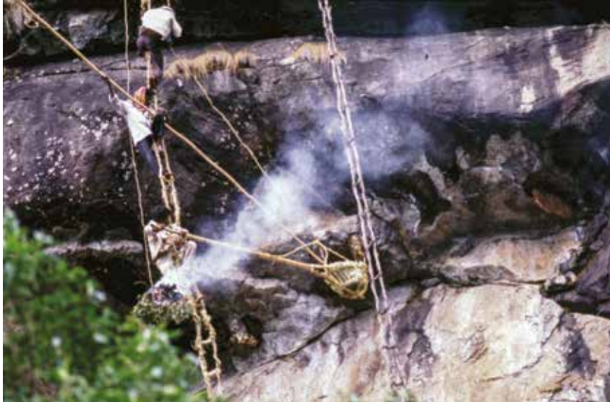
Kurumba men gathering Apis dorsata honey on sheer cliff face

biodiversity value a long while ago. Secondly, recent peat bog studies of plant pollen grains, have established how the Upper Nilgiris looked 40,000 years before the present time. We realise that grasslands have coexisted with sholas for at least forty thousand years. Hence we find the use of the term 'high rainfall grasslands' as annual precipitation can often exceed ten metres.