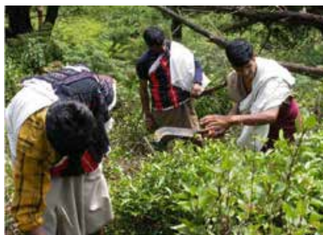
Todas engaged in ecological restoration at EBR

The EBR Centre Trust has acquired – largely through funding from IUCN-NL – around twenty-four acres of land (mostly tea plantation) in the extremely biodiverse Kundah area of the Upper Nilgiris that borders the core area of the NBR. This along with adjacent tracts of private land that are proposed to be acquired in due course is being restored to its original shola-grassland-wetland ecotypes. EBR has a plant nursery where saplings/ seedlings/grasses are being raised for