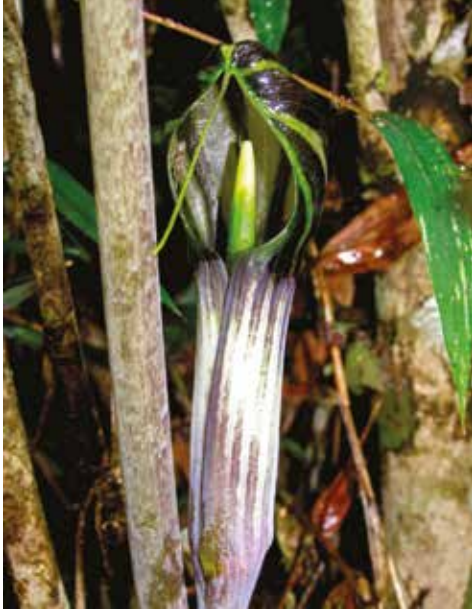
Arisaema translucens : a recently rediscovered endemic species of cobra lily.