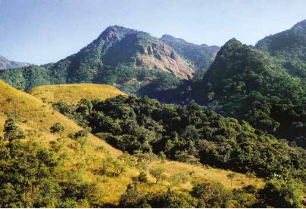
The upper reaches of Silent Valley National Park are a part of the southwest Nilgiris