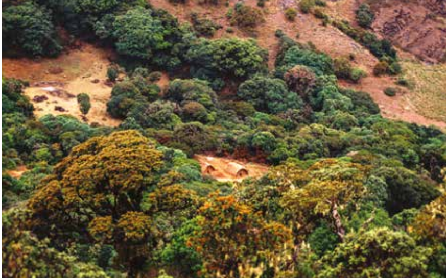
A pristine Toda hamlet

The Todas' relationship with nature begins with their birth rituals. The neonate is merely a passive participant, but its mother is required to handle a number of specific plant species to validate the ritual activity. Later, during the infant's naming ceremony, the grandfather uncovers the child's face outdoors for the first time, pointing out to his grandchild various elements of the natural environment: the rising sun, the birds, the buffaloes, bodies of water, etc. The infant will be named after one or another of these surrounding natural phenomena.