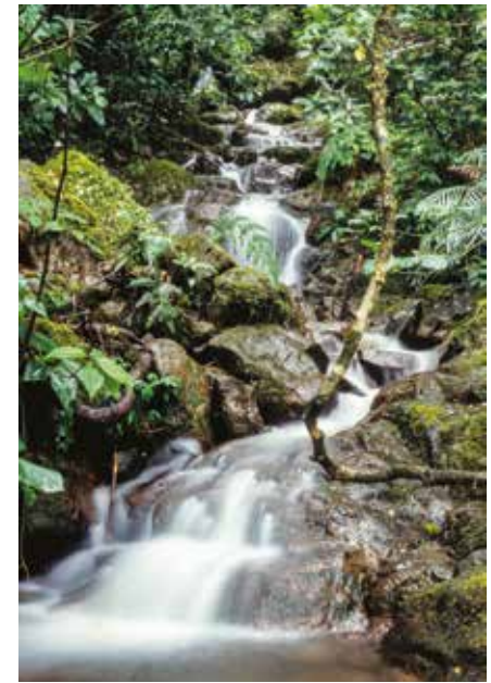
Toda sacred stream in rainforest

The Edhkwelynawd ('place with a spectacular view' in Toda) Botanical Refuge (EBR) is a small oasis in the Upper Nilgiris of south India where a silent movement to restore an ancient ecological landscape is taking shape with the effort of ordinary citizens.