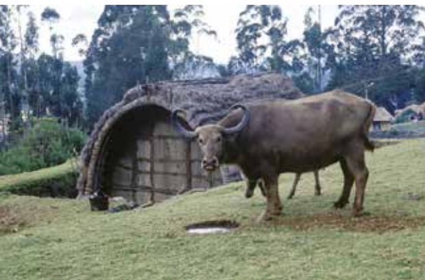
This Toda buffalo breed is confined to the Nilgiris.

Today, the herd size of both sacred and domestic buffaloes has shrunk