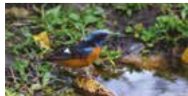
Himalayan guests: Blue-capped Rock Thrush are winter visitors to the Nilgiris.