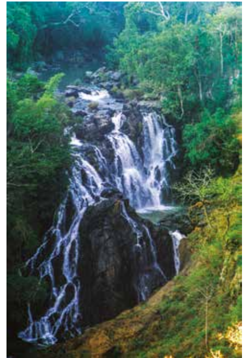
Moist deciduous habitat around the Moyar Waterfall