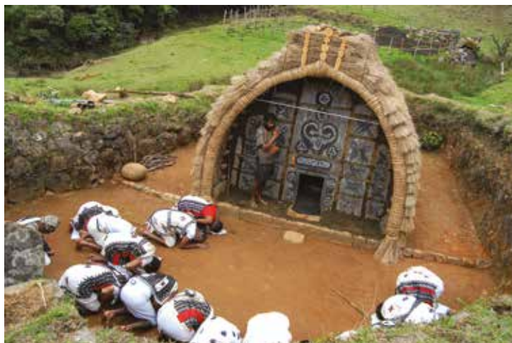
Toda menfolk praying for general well-being, especially of ecosystem

At a time when the Nilgiris is celebrating its bicentennial in 2019, it is worth remembering that these hills have been occupied by the indigenous groups since ancient times, and indeed, the unique flora and fauna were the original colonisers!