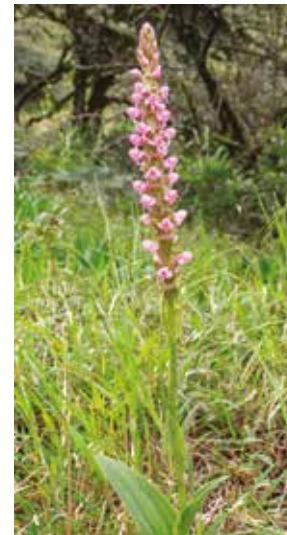
Himalayan connection: Satyrium nepalense in the Nilgiris