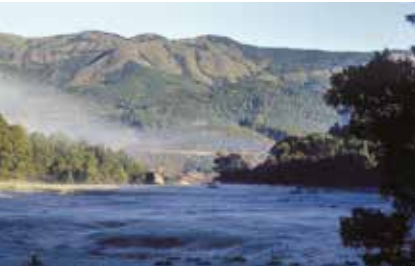
Harsh climatic controls like ground frost contributed to biodiversity development in the Nilgiris

western edges of the Nilgiris are in the form of extremely steep escarpments ensured that such plants had no chance of mixing with their parent stock, thus enhancing their isolation. It is no coincidence that a majority of the Nilgiri endemic plant species are found near these western cliffs. It is for this reason that the upper plateau is sometimes referred to as the Nilgiri Upland Island. As far as this portion of the Western Ghats is concerned, it is apparent that climate changes in the past led to the creation of its phenomenal biodiversity. This is a pertinent point worth remembering in this age of global climate change.